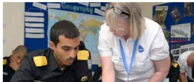
Babcock training services

We have trained over 50 military and merchant crews from over 15 nations, including basic and technical English language training.