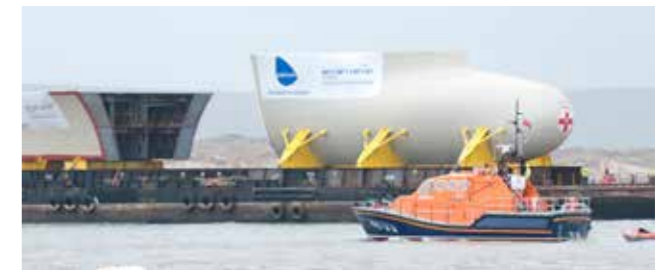
QEC aircraft carrier bow section being transported from Appledore to Rosyth