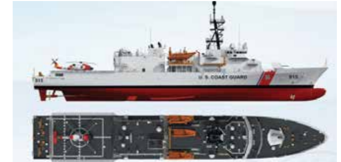
Eastern Shipbuilding Group Offshore Patrol Cutter

Babcock is working collaboratively with a number of key organisations in developing Arrowhead 120 including: