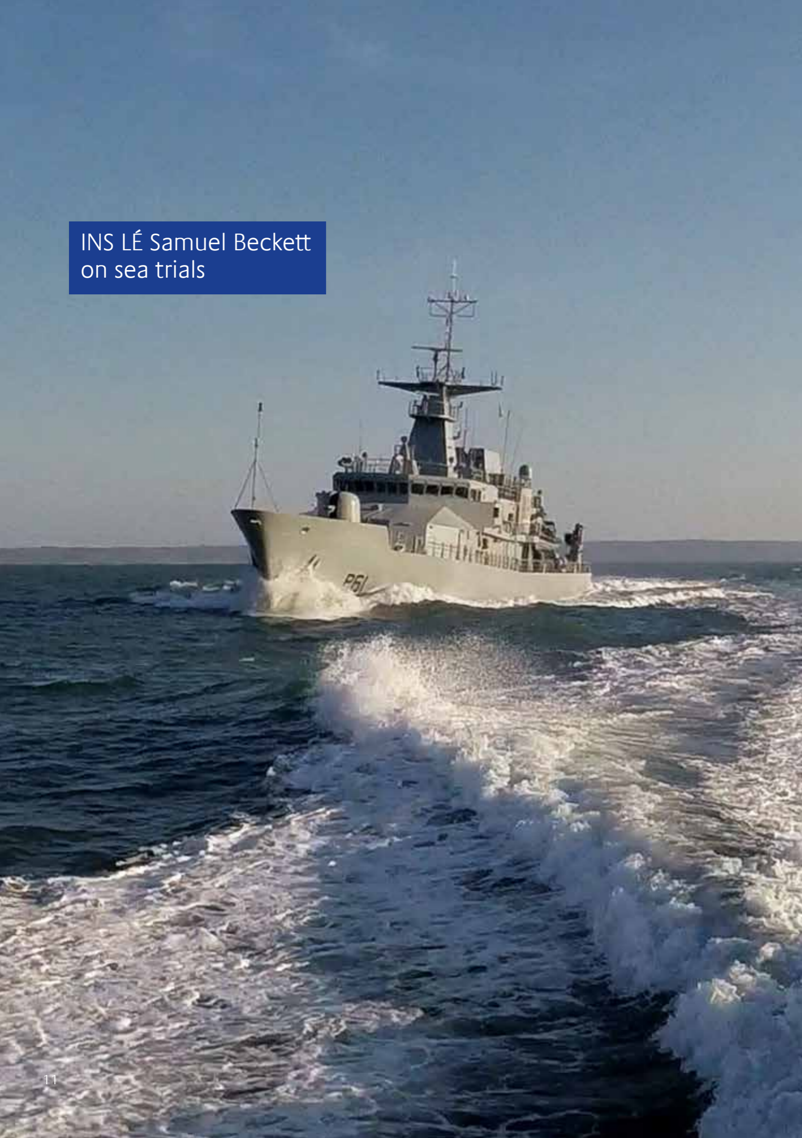
INS LÉ Samuel Beckett on sea trials