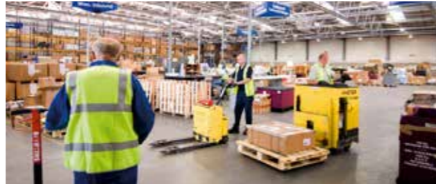
Logistics and warehousing

For our UK Fleet Support operations alone, we procure over £600M of materials and services per year and manage large inventories of equipment under