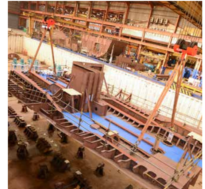
Keel laying of INS LÉ George Bernard Shaw Offshore Patrol Vessel

Arrowhead (Babcock design) can be built and supported within the UK or at international facilities with Babcock's technical support packages.