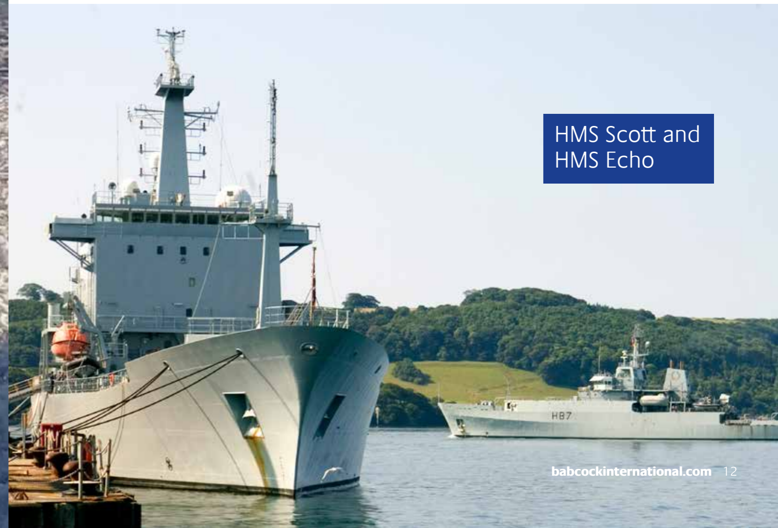
HMS Scott and HMS Echo