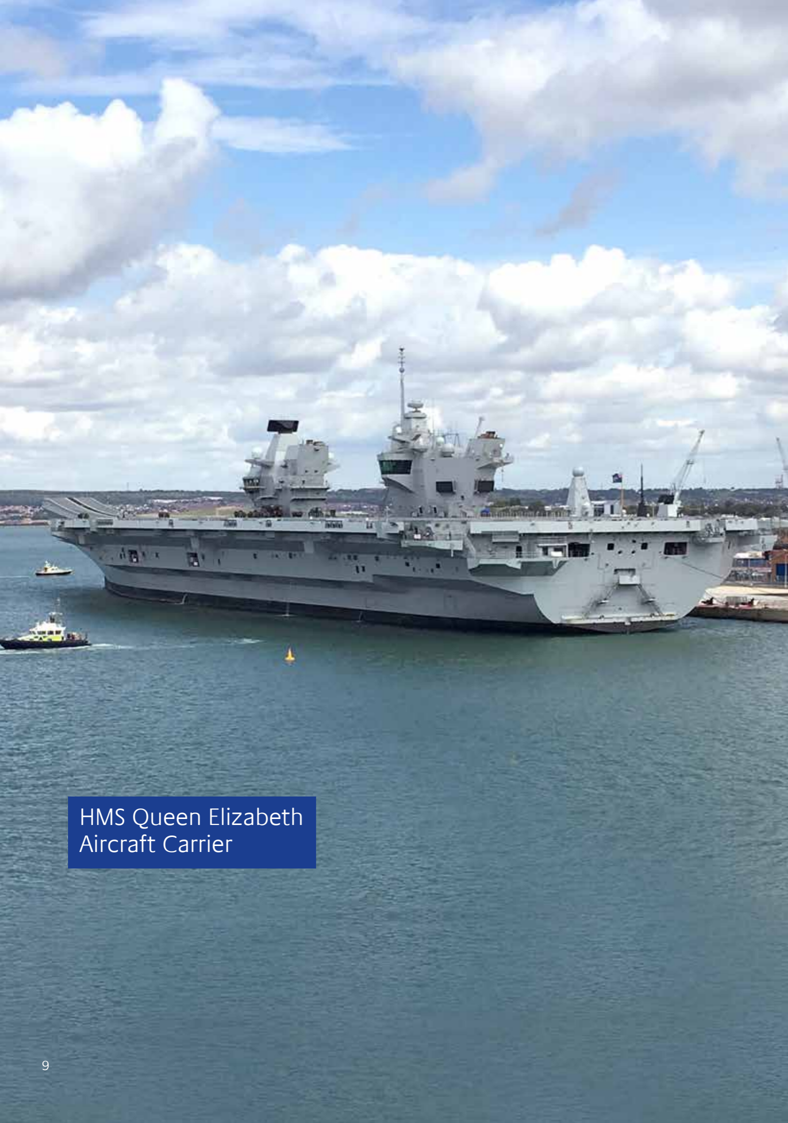
HMS Queen Elizabeth Aircraft Carrier